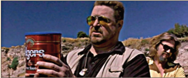
Walter (John Goodman) and The Dude (Jeff Bridges) prepare to scatter the ashes of their friend Donnie (in coffee can) in Joel and Ethan Coen's The Big Lebowski (2005).

In honor of the Frozen Dead Guy Days festival in nearby Nederland, Carroll-Lewellen Funeral & Cremation Services is hosting Laughing in the Face of Death: Funny Films for Funeral Planning . This free upbeat talk in the funeral home's chapel features popcorn, beverages, door prizes, and clips from comedy films and television programs. It's what you need to know before you go!