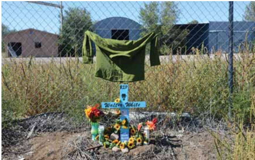
A descanso (roadside memorial) for fictional character Walter White of "Breaking Bad," considered one of the best TV shows of all time.

These days, a funeral and permanent memorialization are no longer "givens" when a death occurs. Yet Walter White, a fictional character, got both—courtesy of grieving fans.